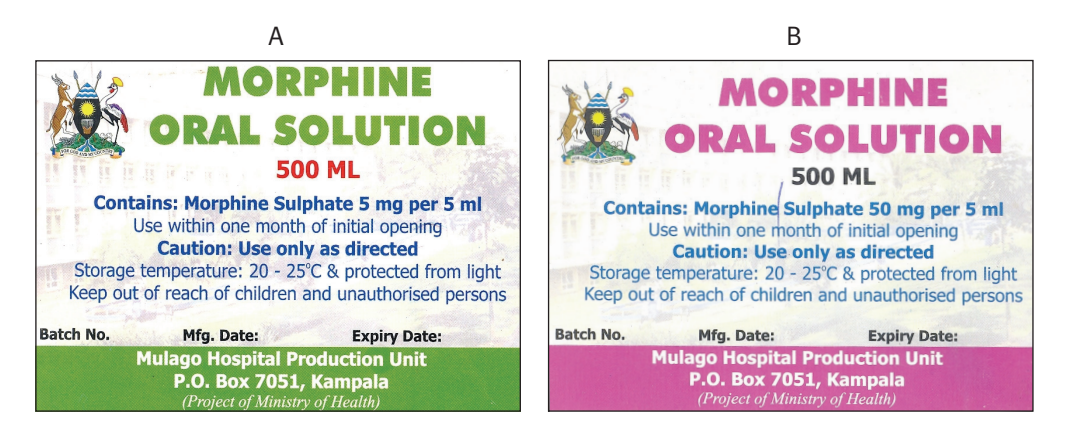
Figure 4: Examples of a Schedule I/II Medicine Labels – 5mg/5mL (A) and 50mg/5mL (B)

Other formulations should also be properly labelled in accordance with internationally accepted standards.