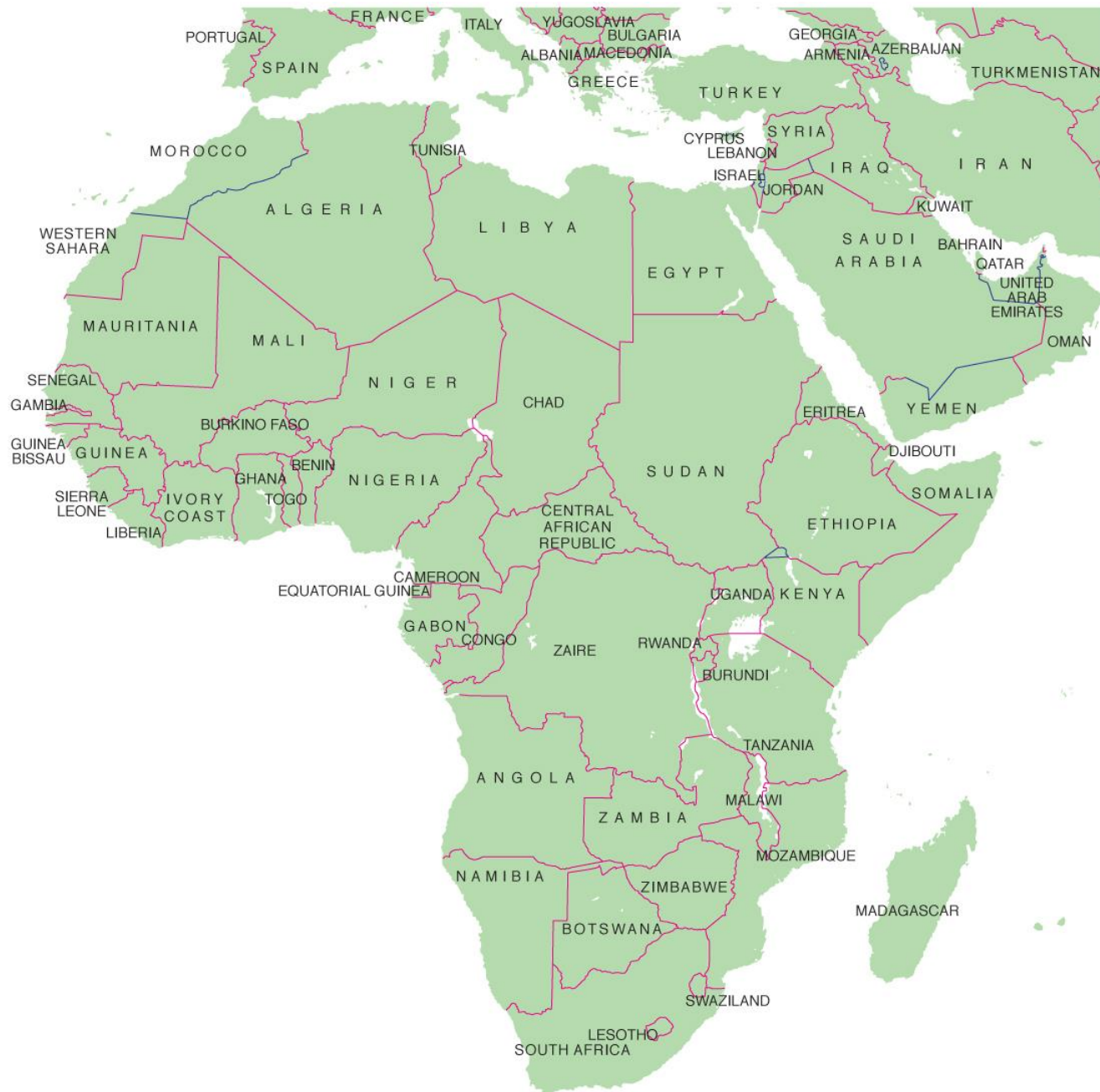
Figure: 1. Countries of Africa

7